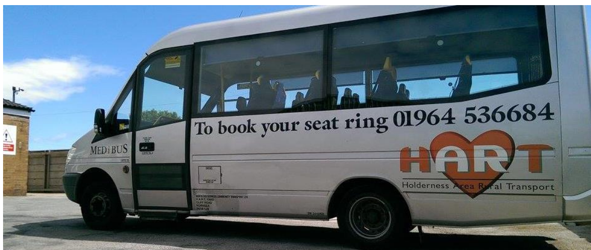
Community Transport Option