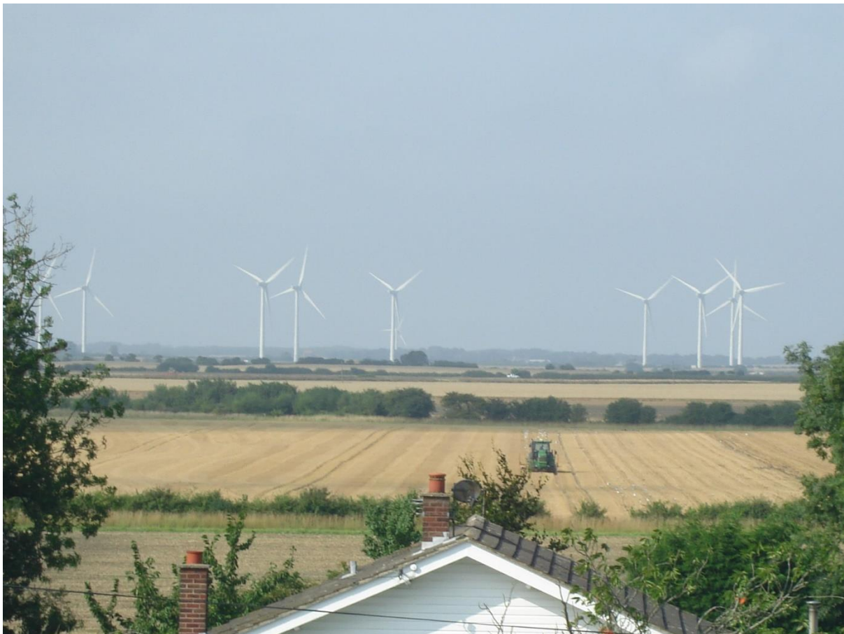
Green in every sense

“Community-Led Planning (also known as Parish Planning) is a tried and tested process already completed by over 4000 parishes and communities nationwide. In our region this has given a voice to over 200 communities, who have used their plans to encourage community spirit and action and also help with funding bids.” Rural Action Yorkshire