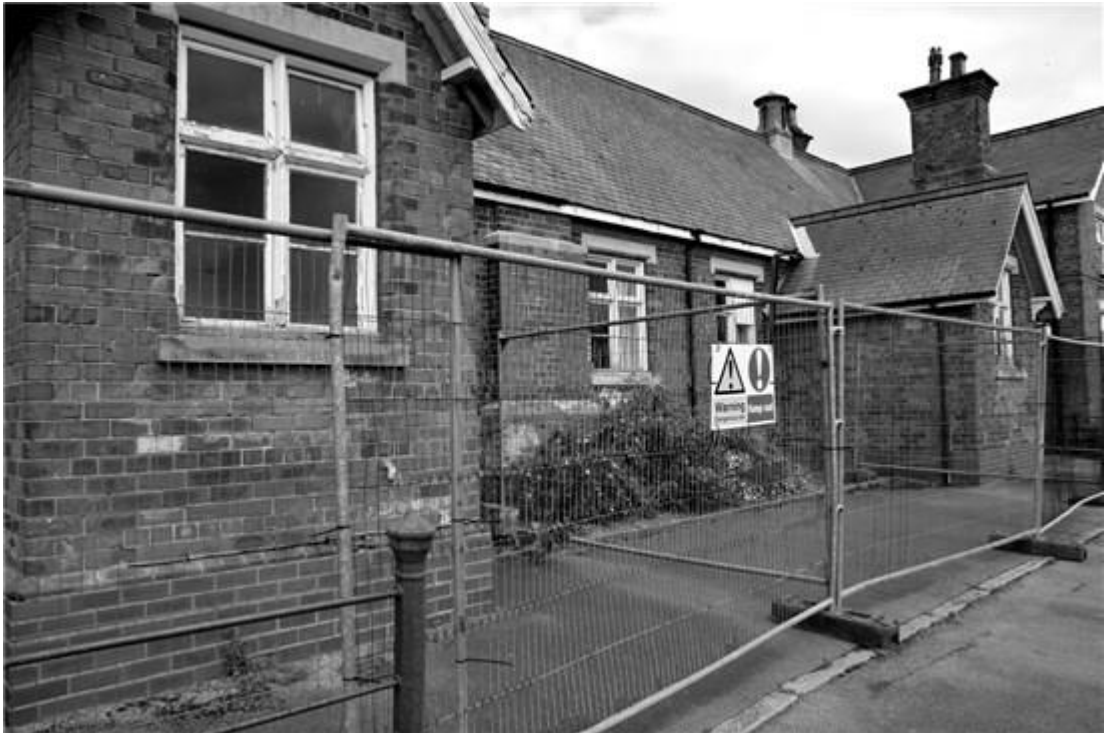
The Old School Building in disrepair