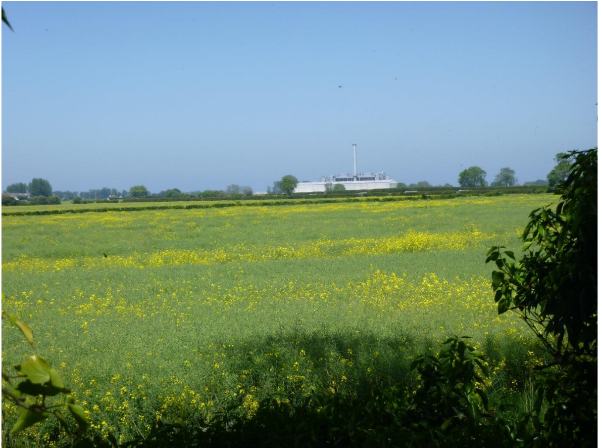
The Biomass Power Plant