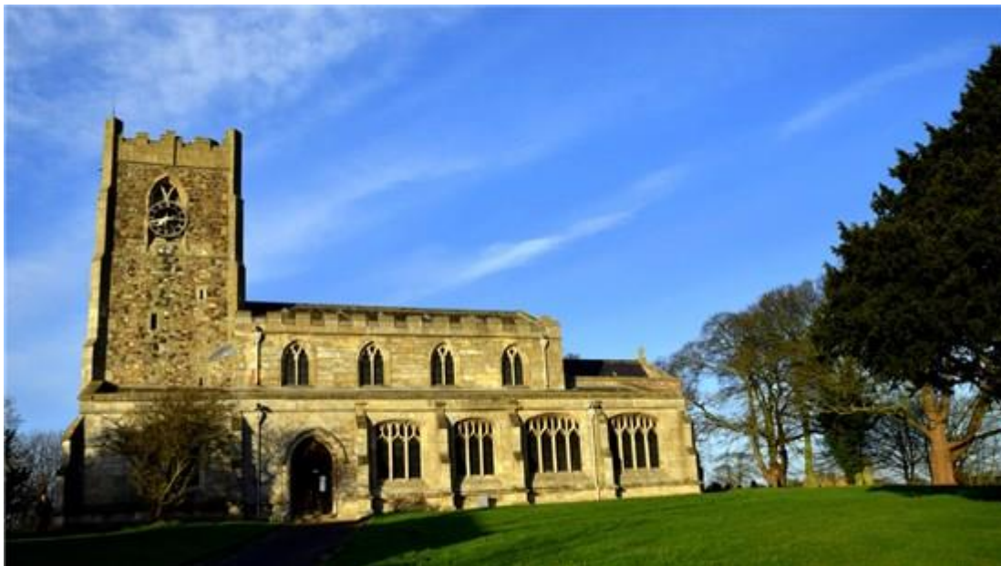
St Peter's Church

This final draft was then made available for one month prior to it being released as the official Community-led Plan for Humbleton & Flinton for 2019. It is intended to follow a similar process in 2020.