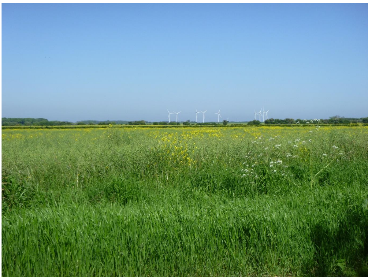
Wind Turbines across the fields