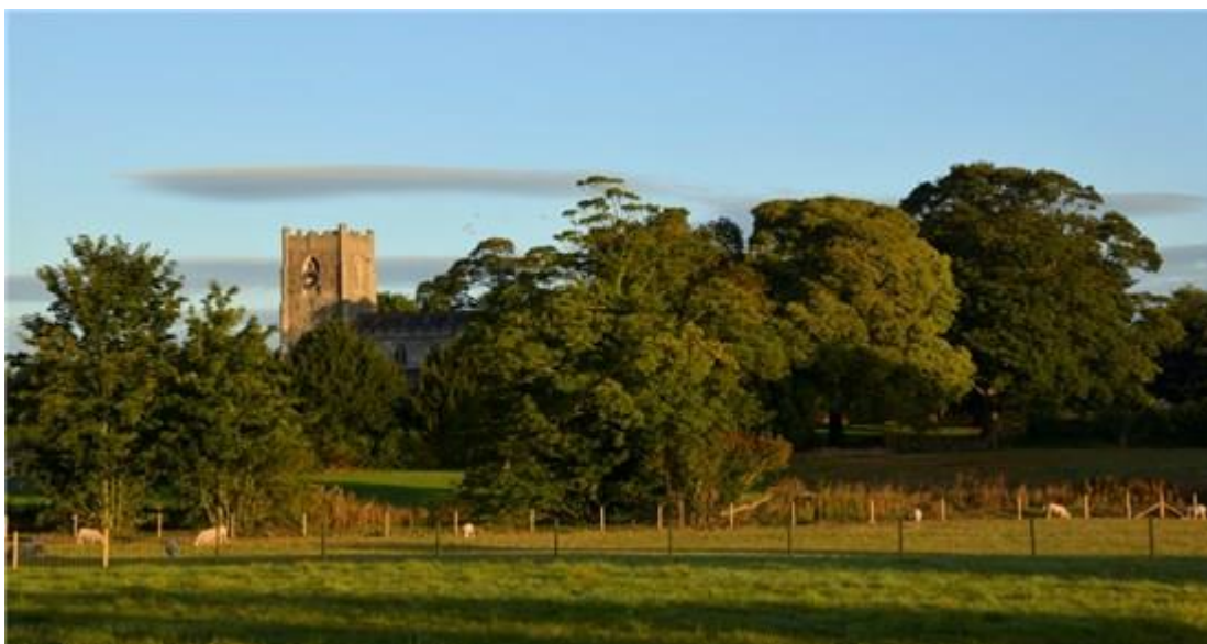
St Peter's Church across village fields

Approximately 4,000 communities across England have already been involved in developing Community Led Plans since the late 1970s. These have allowed communities to take responsibility for making things happen locally, rather than waiting on others to do it for them.