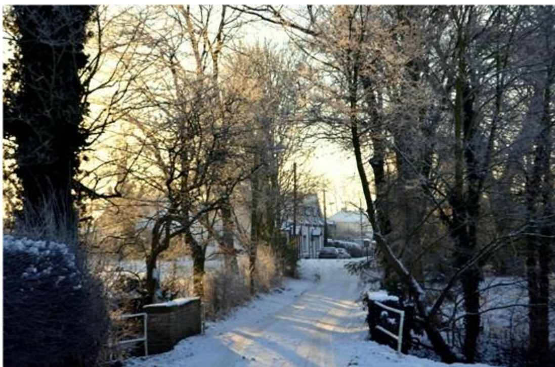
Winter view into Humbleton from the church