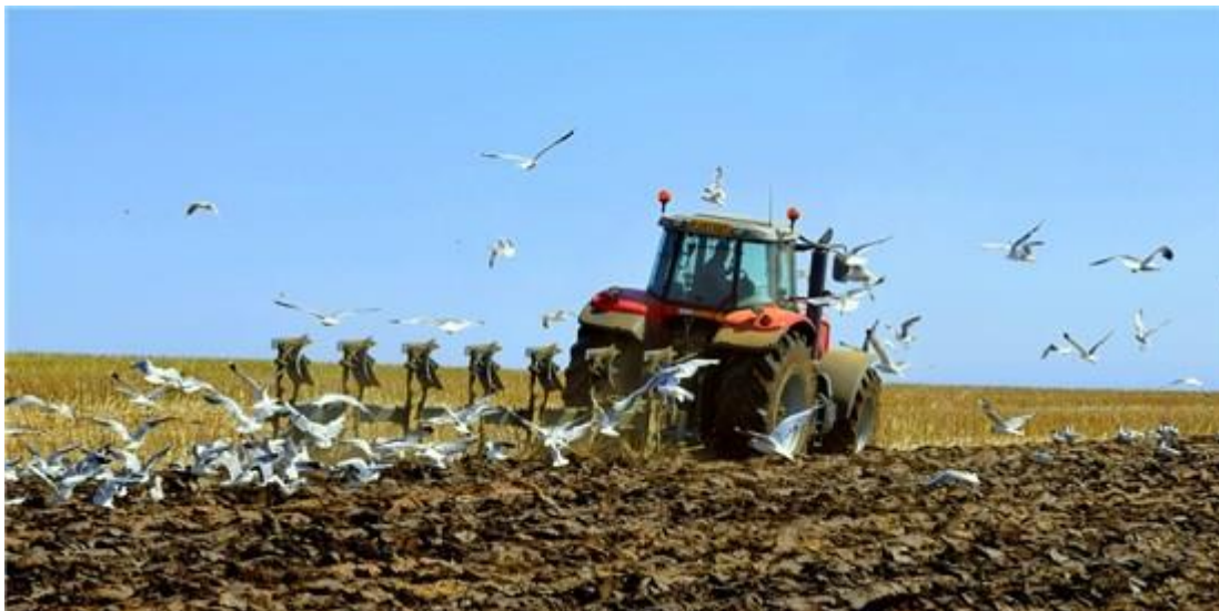
The predominant industry

In the 2011 census, there were 208 people living in the parish with 146 of those of working age (16-64). Approx 37 were aged 0-15 with 25 people aged over 65. The total area of the parish is 1,164.7 hectares.