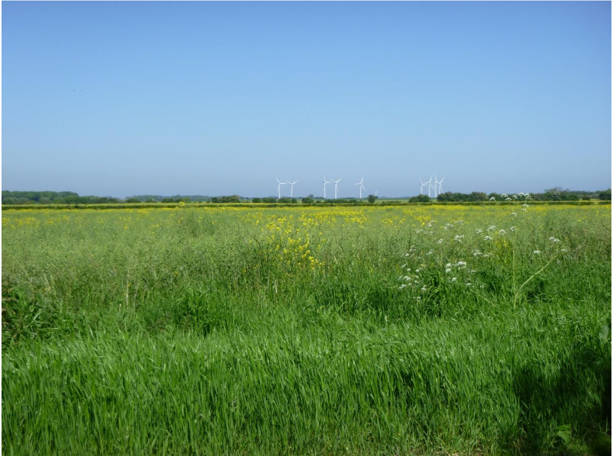
Wind Turbines across the fields