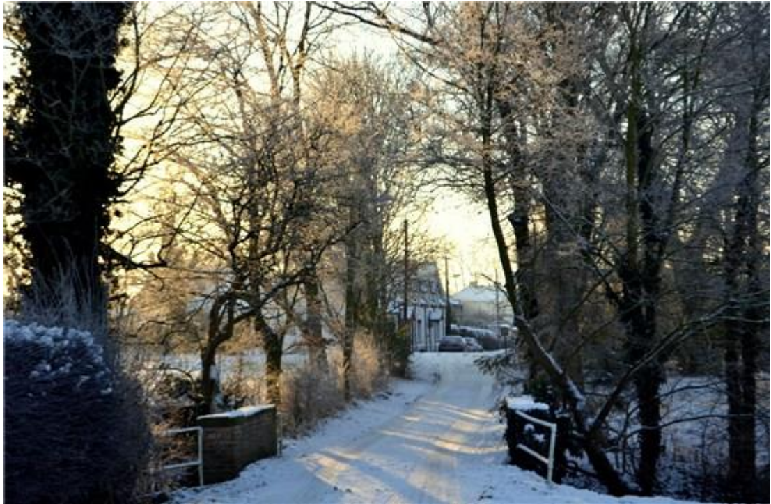
Winter view into Humbleton from the church