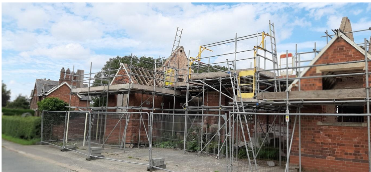
The start of the Old School Building conversion